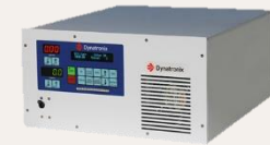
Microstar DP/DPR Series